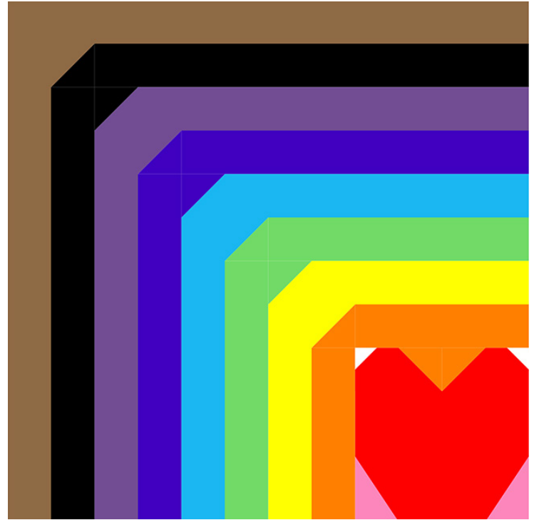
UNFINISHED BLOCK 12.5" x 12.5"

Rewire , shown at Eptek Art and Culture Centre, PEI, and juried into the National Juried Show at Quilt Canada . Heather explored the effects of traumatic brain injury. “Are there tenuous threads linking broken pathways together to form a new way to look at the world?”