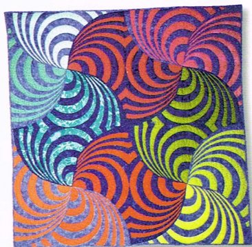
TSUNAMI FORCES 48" x 48"

Hand pieced and hand quilted. This piece was juried into Quilt Canada '98. Her artist statement read: "Tsunami: an unusually large sea wave produced by a seauquake. Occasionally we experience these on the west coast; they inflict flooding and much damage. Hence, my choice of a rather violent tetra colour scheme — but colours that are actually quite harmonious."