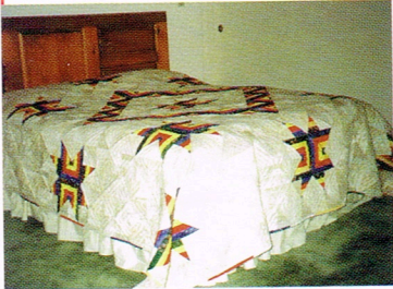
STARFISH BEACH 87" x 95"