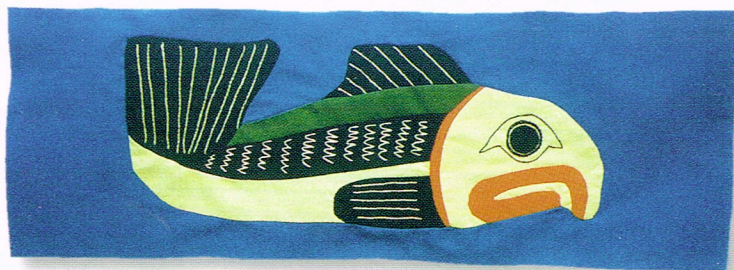
WEST COAST SALMON

Hand appliquéed and embroidered. Hand quilted.