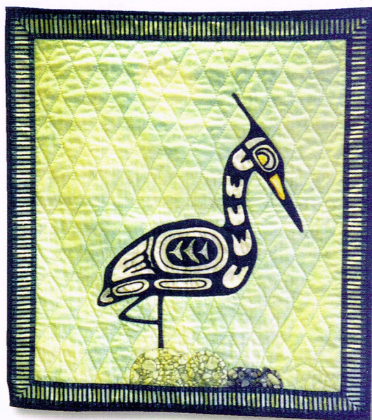
WEST COAST INDIAN HERON 21" x 23"

On her own home turf of Vancouver, she participated in Quilt Canada '98 . One of her workshops called "Herons Fly High" featured a magnificent Heron in a style inspired by a First Nation design. Her other workshop, "Clams on the Half Shell" had participants cutting clam shell shapes in half and playing with the design options to create flowers or abstract designs. Her quilt "Tsunami Forces" was juried into the National Juried Show and was also selected by CQA/ACC as one of twenty quilts to travel to Japan.